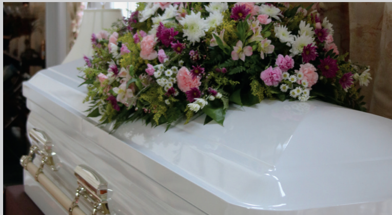
18-Gauge Steel Caskets